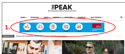
1. Top Banner Ad | 728 x 90 pixels

The Peak has two online ad spaces available currently, the banner and the big box, each available per 1,000 impressions (CPM) or for a monthly flatrate with unlimited impressions. Our website contains all of the articles featured in print, plus a variety of web exclusive content published each week.